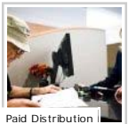
Paid Distribution Which is Better, Annuity or CD? (Fox Business)