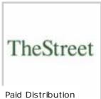
Paid Distribution Foreclosure Activity Up 7% in August (TheStreet)