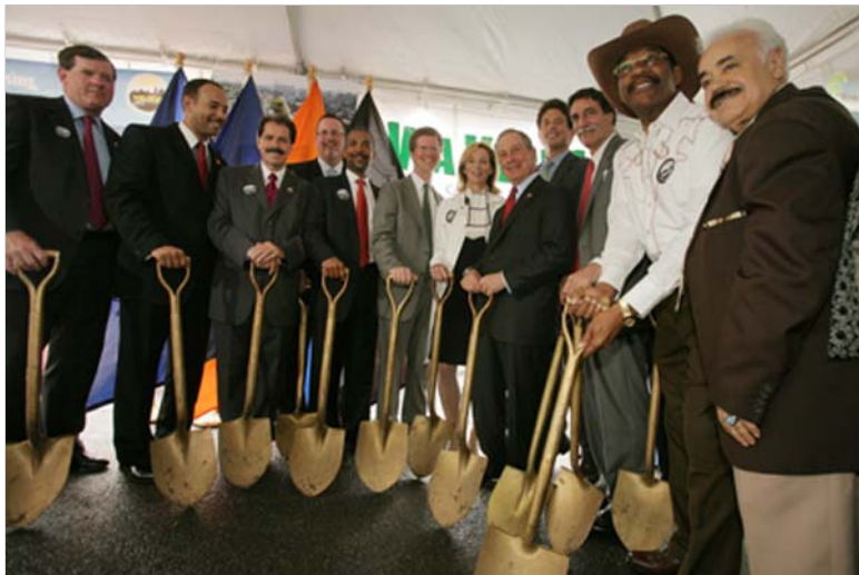
City Hall/City Limits

Mayor Bloomberg and other officials pictured in 2010 as they celebrated the completion of the 100,000th unit of housing under his 2003-2014 housing plan.