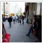
The Poor Have Numbers. Do They Count? (City Limits - News)