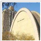
Defeated In Court, Waste Station's Foes Take To The Streets (City Limits - News)