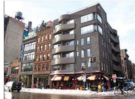
100 West 81st Street

Yes, that's right, $28,000 for an apartment in a pristine Upper West Side co-op building across from the Museum of Natural History.