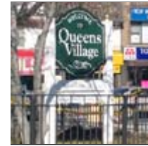
The Least: Queens Village