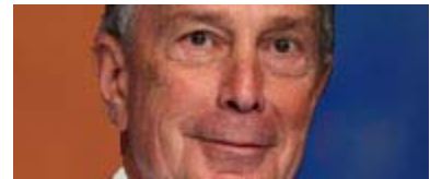
This is the first in a series, to run between now and Election Day, examining Mayor Michael Bloomberg's record in key areas.

A review of the units created by this type of financial incentive shows that the administration is not close to hitting its goal. And given the economy, it is unlikely to anytime soon. What a spokesman from the Department of Housing Preservation and Development calls a "key piece" of the administration's