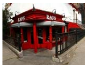
East Harlem Deserves Historic...