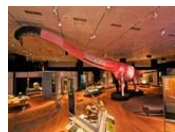
Museum Seeks Smaller Name For Mega...