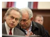
IMF Chief Dominique Strauss-Kahn