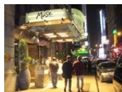
Muse Hotel Agrees to Silence...