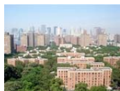
Lower East Side Housing Complex...